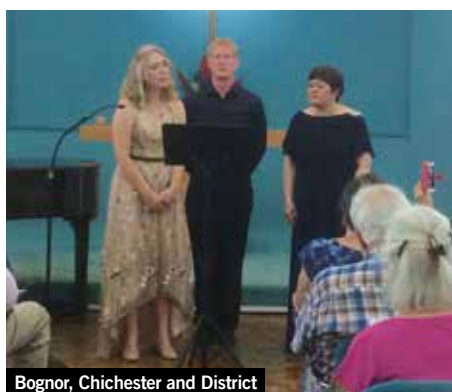
Bognor, Chichester and District