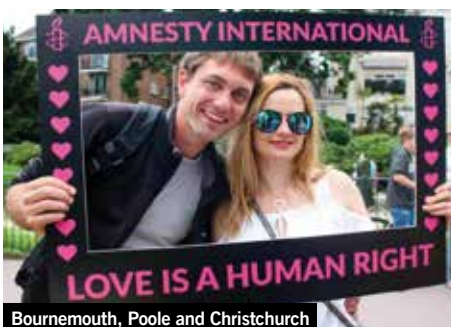
Bournemouth, Poole and Christchurch