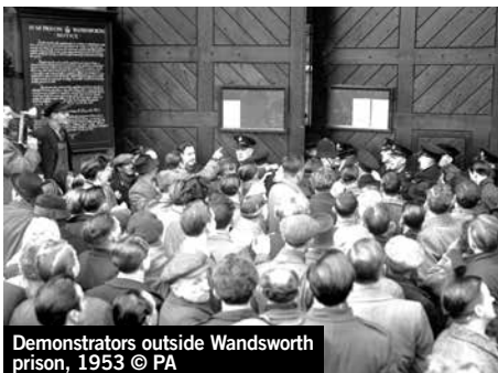
Demonstrators outside Wandsworth prison, 1953