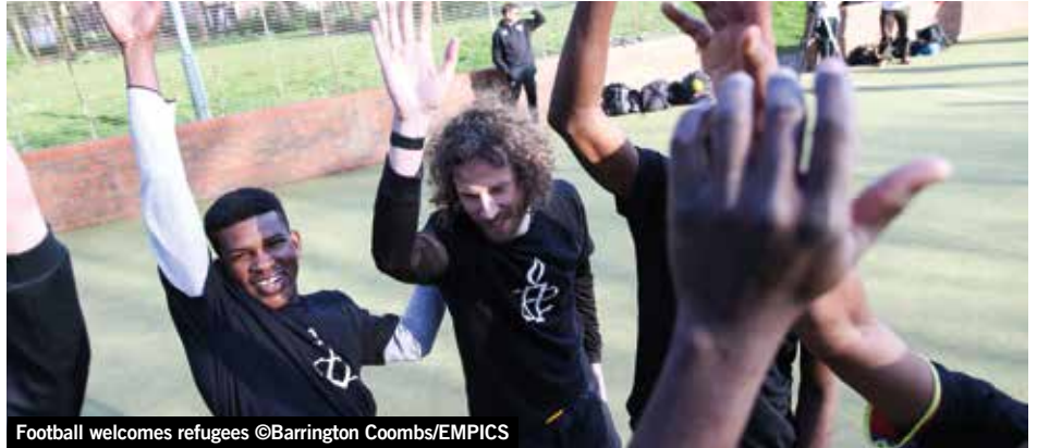
Football welcomes refugees