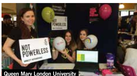
Queen Mary London University