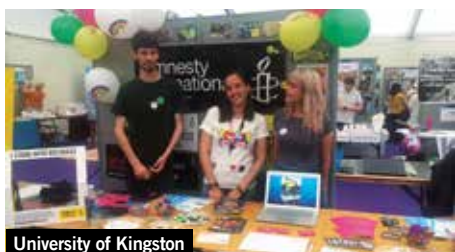
University of Kingston