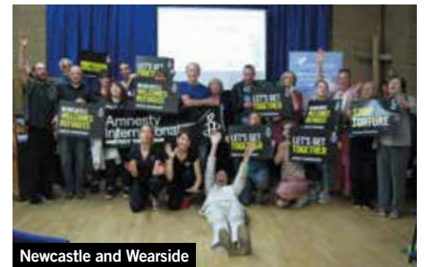
Newcastle and Wearside