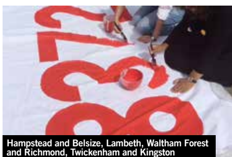
Hampstead and Belsize, Lambeth, Waltham Forest and Richmond, Twickenham and Kingston