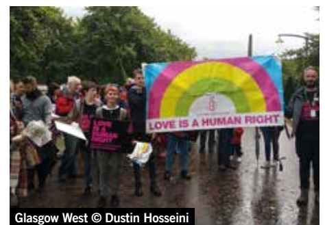
Glasgow West © Dustin Hosseini