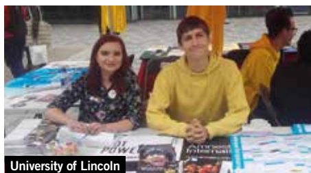
University of Lincoln