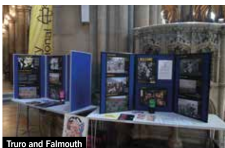
Truro and Falmouth