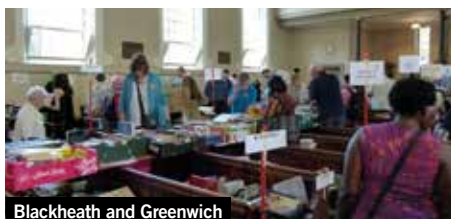
Blackheath and Greenwich