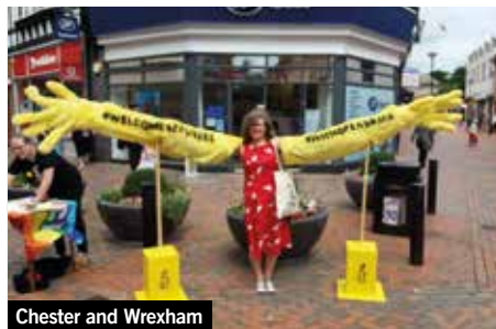
Chester and Wrexham