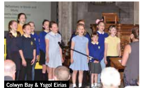
Colwyn Bay & Ysgol Eirias