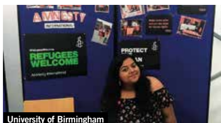
University of Birmingham