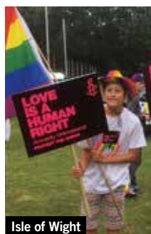
Isle of Wight