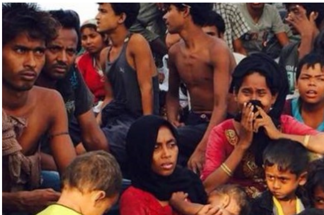
An image of the Rohingya community

Please, find a link to Amnesty's report on Myanmar: https://www.amnesty.org/download/Documents/ASA1633552020ENGLISH.pdf