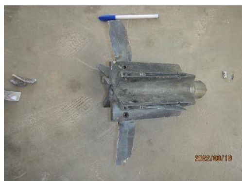
Remnant of the 120mm tank round that hit the home of the al-Amour family at about 3.55pm on 5 August 2022

Duniana was pronounced dead shortly after she reached the hospital, while her mother, Farha, who was also taken to hospital, and her sister Areej were released on the same day, having sustained light injuries from shrapnel.