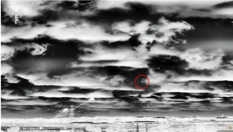
Snapshot of a video published by Israeli army on 6 August 2022 claiming to show a barrage of Palestinian rockets being fired and to identify, with a red circle, a rocket that misfired

On 6 August 2022, at 9.02pm, just as the night-time call to prayer was sounding from the loudspeaker of a nearby mosque, a rocket killed seven Palestinian civilians, including four children, and wounded at least 15 others in Jabalia refugee camp. The rocket damaged dozens of houses on both sides of Trance Street, a main road in the camp. The seven Palestinians killed in the attack were: Momen al-Neirab, aged six; Hazem Salem, aged eight; Ahmad al-Neirab, Momen's brother, aged 12; Ahmad Farram, aged 16; Khalil Abu Hamada, aged 18; Muhammad Zaqqout, aged 19; and Nafeth al-Khatib, aged 50.