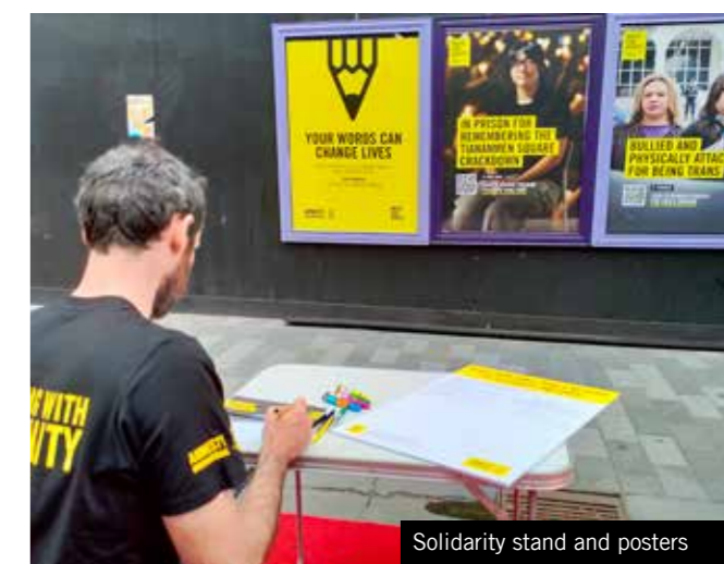
Solidarity stand and posters

Also visit amnesty.org.uk/organise-event