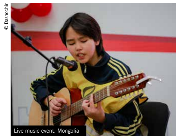
Live music event, Mongolia

Live music Busking sessions, open-mic nights, barn dances, day-long jazz concerts, inviting a choir or someone to play the guitar while