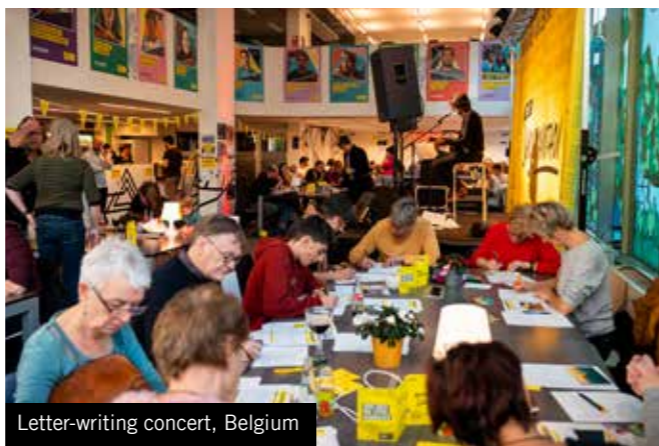
Letter-writing concert, Belgium

If you've organised an event or done something creative and impactful in the past, please tell us about it so we can share it with the movement to inspire others. Also let us know if you find this toolkit useful: email us at activism@amnesty.org.uk or contact your community organiser.