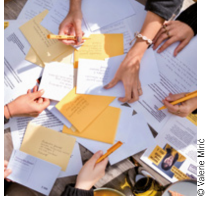
Letter writing with friends in Czechia for Write for Rights 2023.

HAVE THE SPACE required for them to engage emotionally and develop their own attitudes.