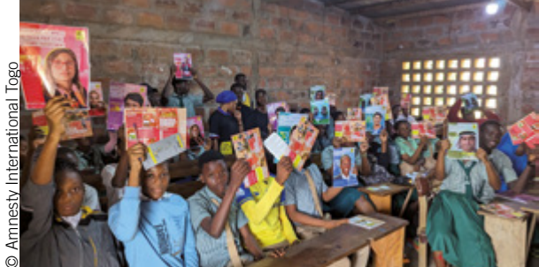
Amnesty supporters in the Netherlands (far left) and Togo (left) at events for Write For Rights 2023.