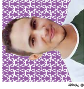
5. EGYPT OQBA HASHAD