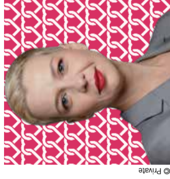
3. BELARUS MARYIA KALESNIKAVA