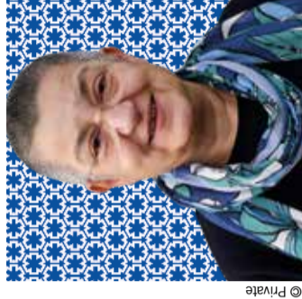
8. TÜRKIYE PROFESOR ŞEBNEM KORUR FİNCANCI