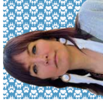
4. CANADA WET'SUWET'EN NATION LAND DEFENDERS