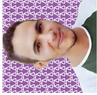
5. EGYPT OQBA HASHAD

© Amnesty International (Photo: Aili McCracken)