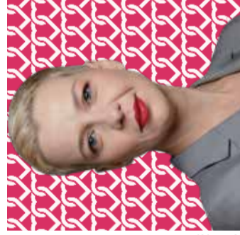
3. BELARUS MARYIA KALESNIKAVA