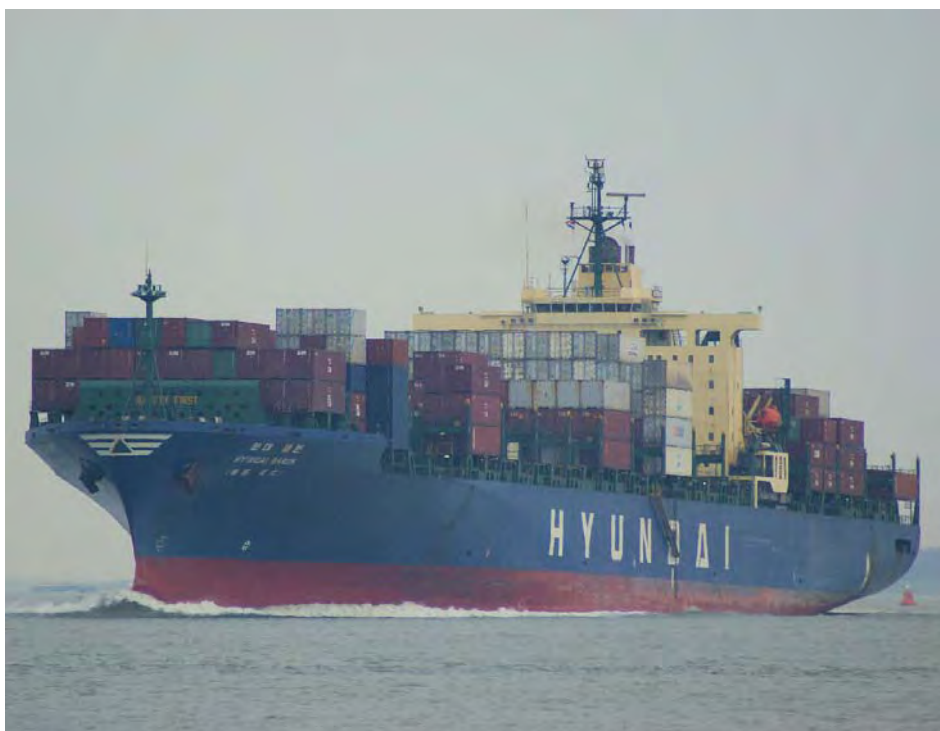
MV Hyundai Baron, which transported components of 155mm K-310 cluster munition artillery shells to Pakistan in April 2009

The UK passed legislation in October 2008 which effectively prohibits UK individuals and companies, including UK-registered companies, from doing “any act calculated to promote the supply or delivery” of a range of prohibited weapons, including cluster munitions and their components, “where that person knows or has reason to believe that such action or actions will, or may, result in the removal of those goods from one third country to another third country.” 35 Amnesty International contacted Zodiac Maritime Agencies Ltd in December 2009 expressing the organisation’s concerns that a cargo carried on one of their vessels may have consisted of components for K310 cluster munitions, noting the relevant UK legislation, and requesting further details about the cargo. 36 Nonetheless in February 2010 revenue authority documents show that a further 1.515 metric-ton consignment from Poongsan Corporation of inert components for K-310 artillery shells – again described in detail on shipping documents as 4 pallets of “OF155MM K310 TP PROJECTILE (DUMMY)” – was transported to Karachi by the MV Hyundai Emperor , another UK-flagged vessel listed on the fleet list of Zodiac Maritime Agencies. 37