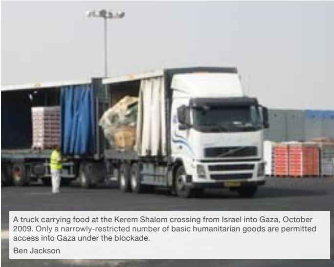
A truck carrying food at the Kerem Shalom crossing from Israel into Gaza, October 2009. Only a narrowly-restricted number of basic humanitarian goods are permitted access into Gaza under the blockade.