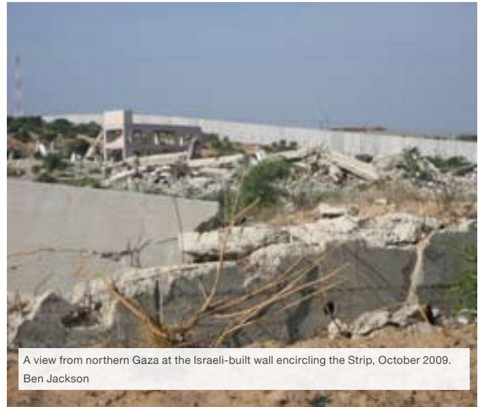
A view from northern Gaza at the Israeli-built wall encircling the Strip, October 2009. Ben Jackson

While Israel has a duty to protect its citizens, the measures it uses to do so must conform to international humanitarian and human rights law. Indiscriminate attacks by Palestinian armed groups in southern Israel, which have killed several civilians and injured dozens more, are a clear violation of international humanitarian law. We condemn such indiscriminate attacks against civilians. Abuses of international law by one side, no matter how serious, can never justify abuses by the other side. By enforcing the blockade on the Gaza Strip, Israel is violating the absolute prohibition on collective punishment in international humanitarian law, 67 punishing the entire population of Gaza for the acts of a few.