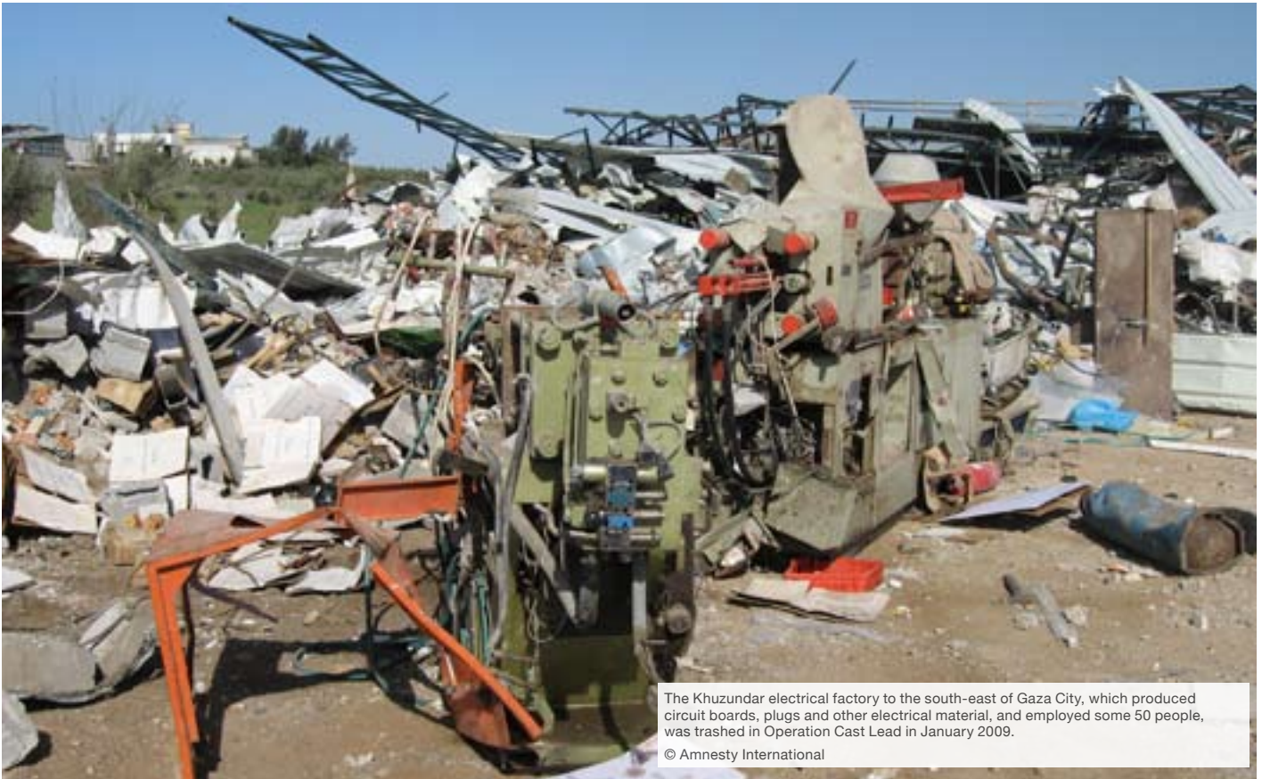
The Khuzundar electrical factory to the south-east of Gaza City, which produced circuit boards, plugs and other electrical material, and employed some 50 people, was trashed in Operation Cast Lead in January 2009.