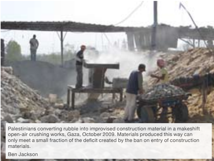
Palestinians converting rubble into improvised construction material in a makeshift open-air crushing works, Gaza, October 2009. Materials produced this way can only meet a small fraction of the deficit created by the ban on entry of construction materials.