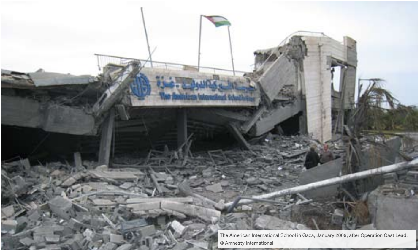
The American International School in Gaza, January 2009, after Operation Cast Lead.