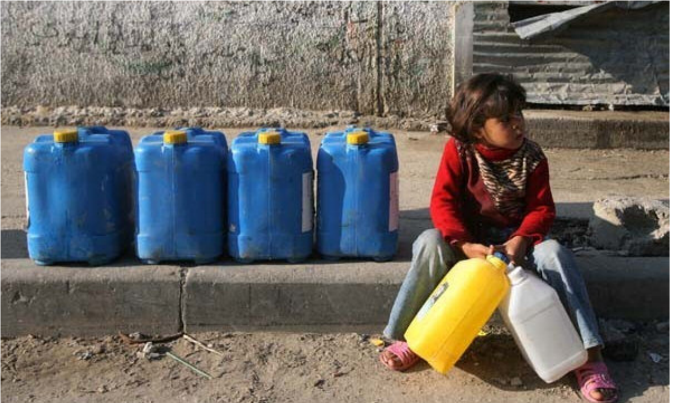
A Palestinian girl takes a rest on her way to collect drinking water in Gaza, where more than 90 per cent of the water available is polluted and unfit for human consumption.