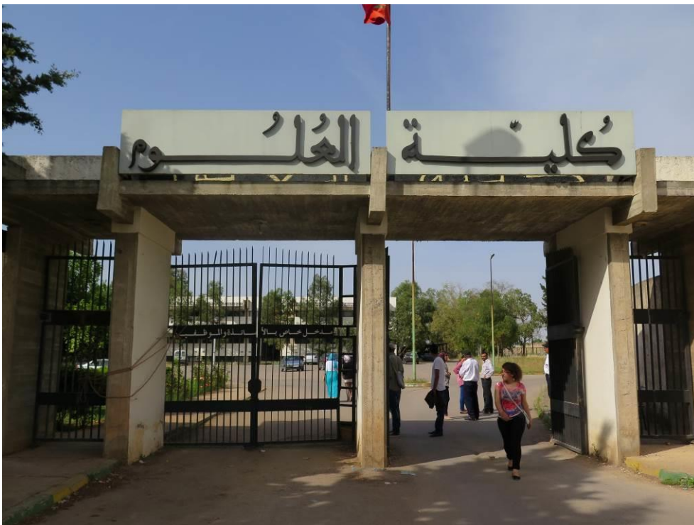
Photo: Science Faculty, Dhar El Mehrz campus, Sidi Mohamed Ben Abdellah University in Fes