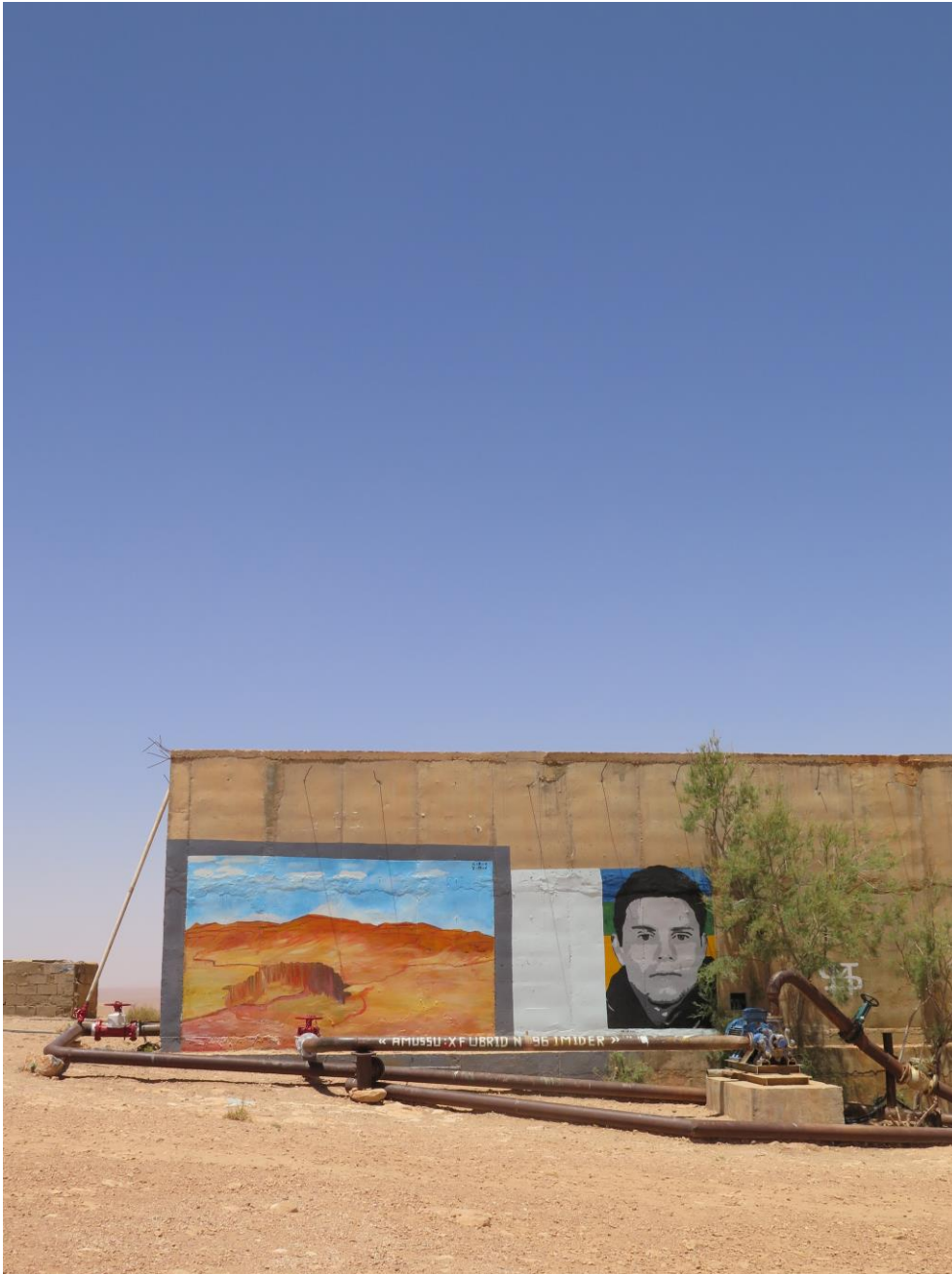
Photo: Wall painting of jailed activist Moustapha Ouchtoubane on Mount Alebban near the Imidr silver mine