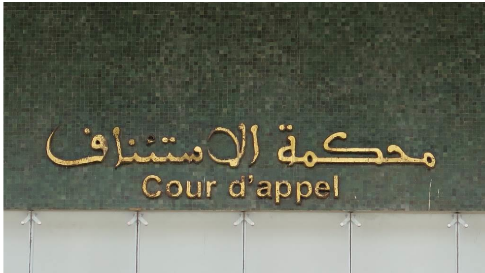
Photo: Agadir Court of Appeals whose landmark ruling in August 2014 overturned a conviction based on a torture-tainted police interrogation report.

In a rare decision, the Criminal Chamber of the Agadir Court of Appeals quashed a guilty verdict for drugs charges against a detainee who alleged torture, in August 2014. The court granted a medical examination which was performed in the Guelmim military hospital. It concluded that he had been tortured in garde à vue detention including though beatings, blows to the head that perforated his eardrum, and cigarette burns, following his arrest in Guelmim in June 2014. Authorities announced an investigation into the alleged torture, and have yet to make conclusions public.