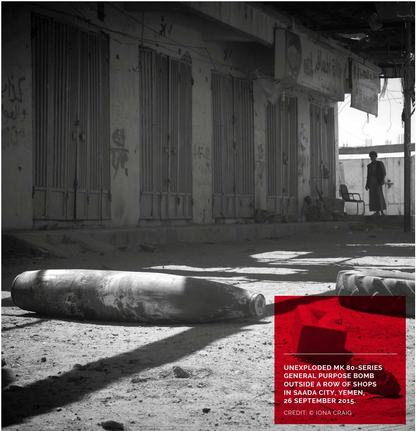
UNEXPLODED MK 80-SERIES GENERAL PURPOSE BOMB OUTSIDE A ROW OF SHOPS IN SAADA CITY, YEMEN, 26 SEPTEMBER 2015.

ANY RIGOROUS RISK ASSESSMENT WILL REVEAL AN OVERRIDING RISK THAT THE EXPORT OF LETHAL MILITARY EQUIPMENT TO SAUDI ARABIA IN CURRENT CIRCUMSTANCES IS LIKELY TO BE USED IN FURTHER VIOLATION OF IHL AND IHRL IN YEMEN. SUCH EXPORTS SHOULD THEREFORE BE REFUSED BY ALL ATT STATES PARTIES.