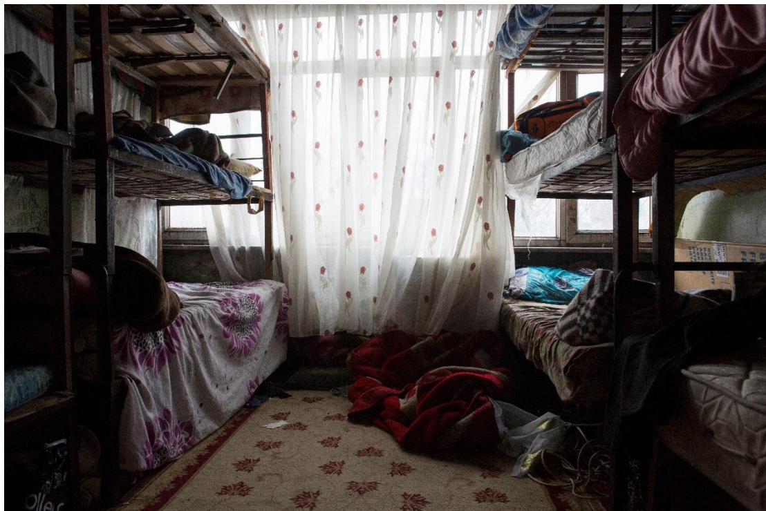
About 12 asylum-seekers from Afghanistan live in this room in Istanbul, below which is an industrial operation where the recyclable materials that they collect from the garbage are weighed and sorted.

This chapter assesses whether Turkey meets the third criterion for effective protection: access to means of subsistence sufficient to maintain an adequate standard of living. With state authorities unable to meet people’s basic needs – in particular shelter – combined with the significant barriers that people experience in achieving self-reliance, the reality is that Turkey is failing to provide an environment where asylum-seekers and refugees can be guaranteed the ability to live in dignity.