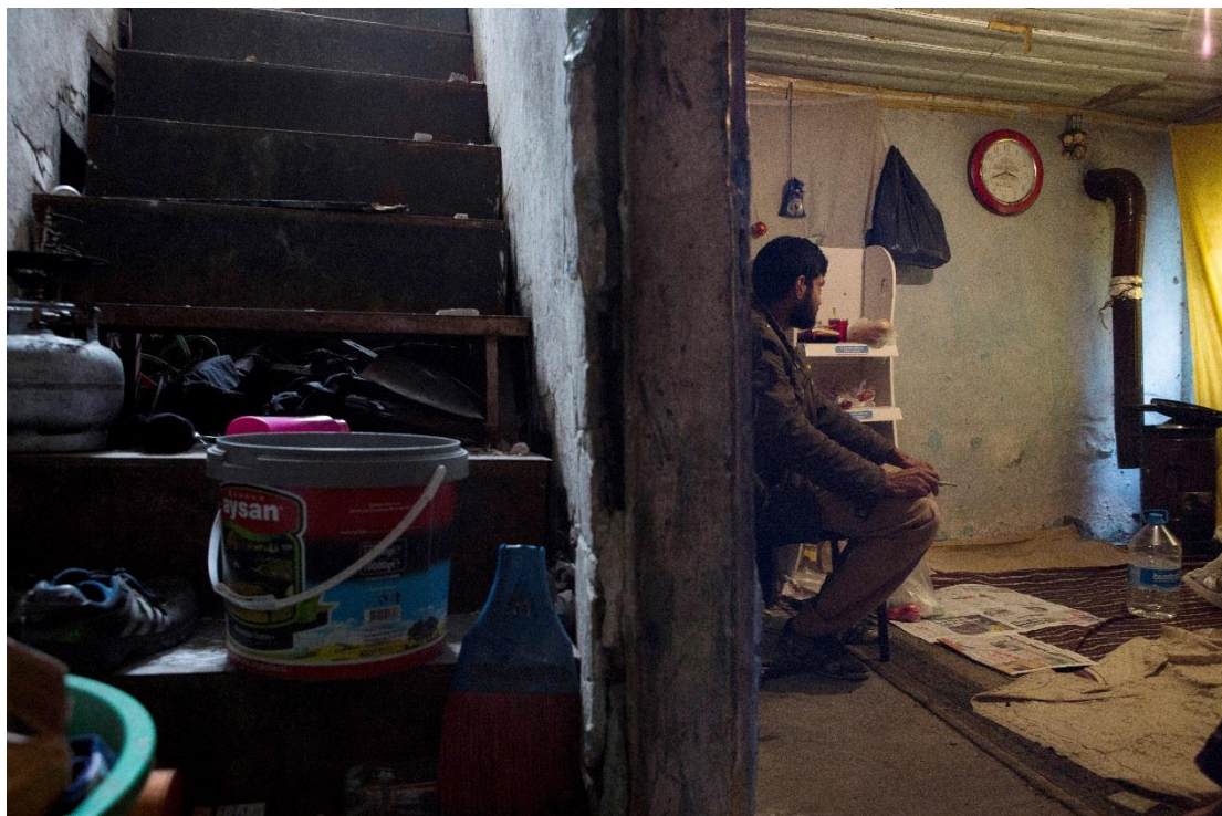
An Afghan asylum-seeker living in Istanbul. Afghans have no realistic prospect of either being integrated in Turkey or resettled to another country.

This chapter discusses the second requirement for the return of asylum-seekers and refugees to Turkey under the EU-Turkey Deal, namely that people are able to access what are known as “durable solutions.” UNHCR has identified three possible ways in which this obligation can be met: repatriation (when safe to do so) to countries of origin, integration in host countries, and resettlement to third countries. In the absence, to date at least, of a large scale resettlement programme from Turkey, and with little prospect of safe return for Syrians, and indeed many other refugees, the question of the long-term status and attendant rights of persons in need of international protection becomes particularly important. Turkey’s ability to provide durable solutions to refugees is severely compromised, however, by the continuing denial of full refugee status to non-Europeans.