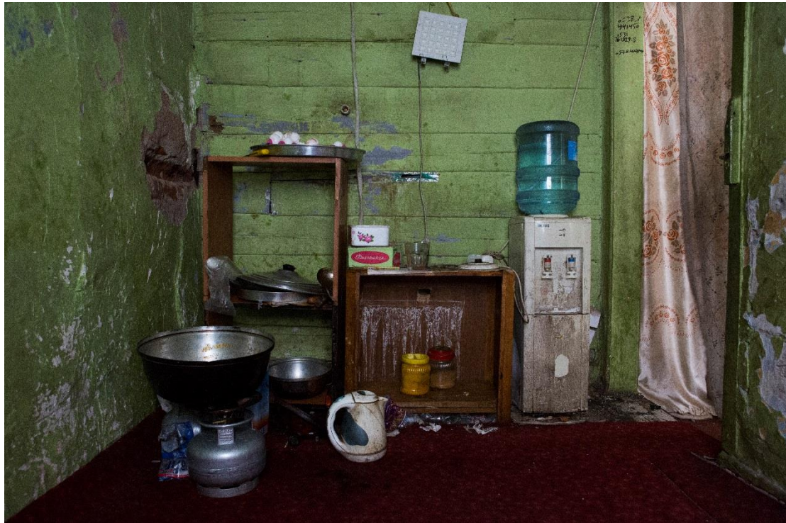
The kitchen for 15 Afghan and Pakistani asylum-seekers living in Istanbul.

living in one small and partly underground room; two single beds, a table, and a refrigerator occupied virtually the entire space. 95