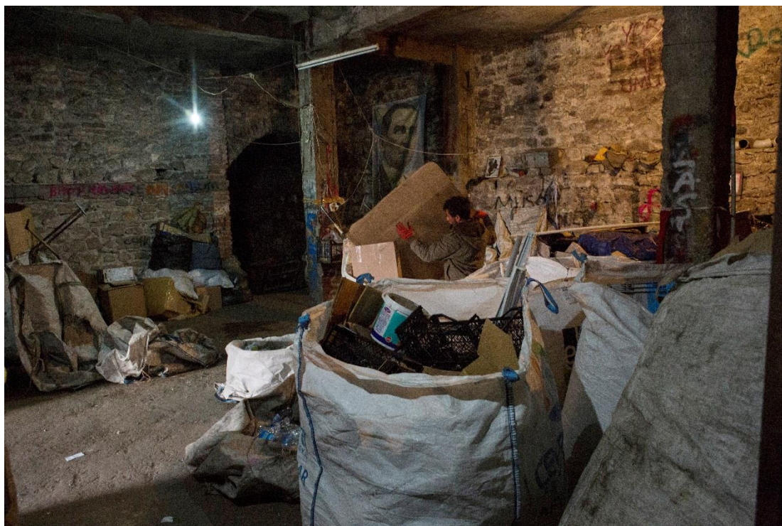
Many Afghan asylum-seekers support themselves in Istanbul by selling recyclable materials they collect from garbage bins, which is later weighed and sorted in depots such as this operation.

Children needing to work to meet the basic needs of their families is a widespread problem, despite this being contrary to Turkey's domestic and international legal obligations. 130 UN agencies report that among Syrian refugees in the country, "child labour is a common phenomenon." 131 In a 2015 survey of over 700 Syrian refugees in Istanbul, the most common reasons for children's non-enrolment in school were that the children needed to work to support the family (26.6%) and that the family could not afford the school fees (20.3%). 132 A Syrian mother of three boys, living in Gaziantep, told Amnesty International that the shrapnel injuries her husband sustained in Syria prevent him from working, and that the entire family of seven survives on the 5-10 Turkish Lira per day (about 1.75 to 3.50 USD) that her nine-year old son earns working at a grocery store. 133 An Iraqi man from Dohuk, living in Istanbul, said that his three children – a daughter aged 18 and two sons aged 17 and 16 – cannot attend school but must work instead. He said: "They must work; otherwise we cannot survive." The 18-year old daughter told Amnesty International that she and her brothers work in a textile factory five days a week, from 8 a.m. until 7:30 p.m., and each make 250 Turkish Lira (about 88 USD) per week. The father said that he was unable to find a job that did not require very long hours, which he is unable to do because he says he is old and tires easily. 134