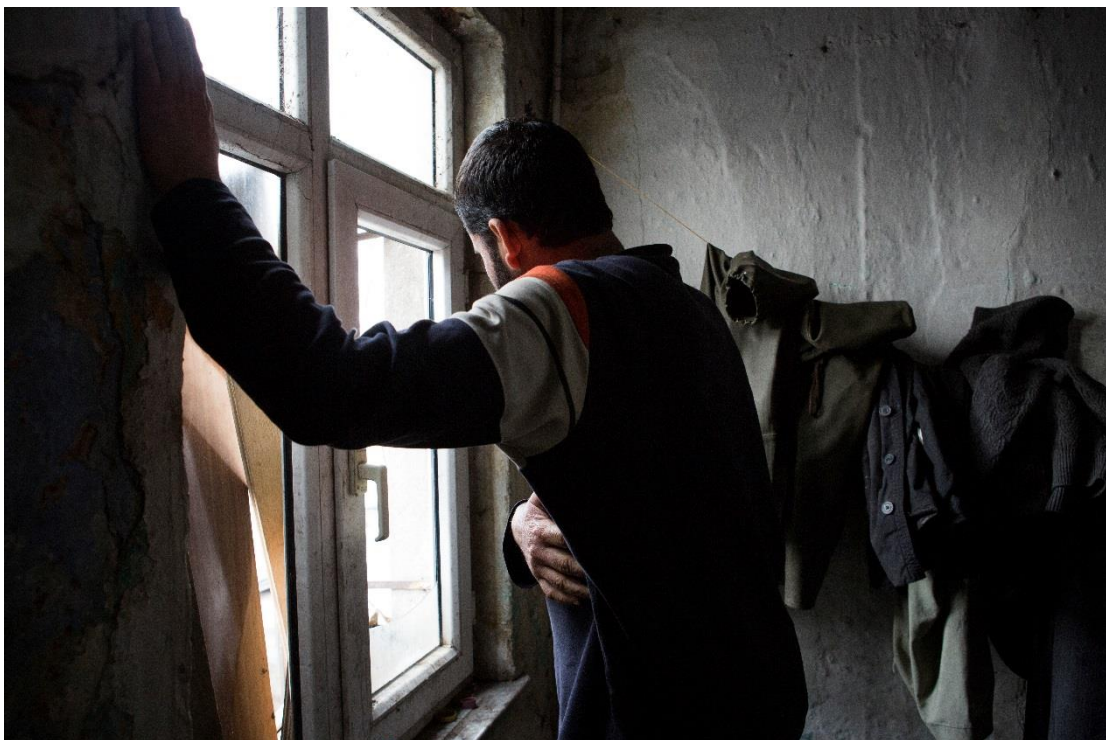
An Afghan asylum-seeker looking out from his flat in Istanbul.

EU member states should be looking at activating such a scheme, in meaningful numbers, without delay.