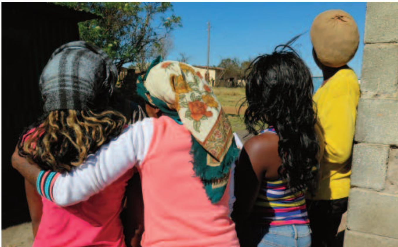
These four young women in Mpumalanga were all teenage mums. They said they had not used contraceptives before they became pregnant and believe more information about contraception should be provided to girls and boys at an earlier age at school.